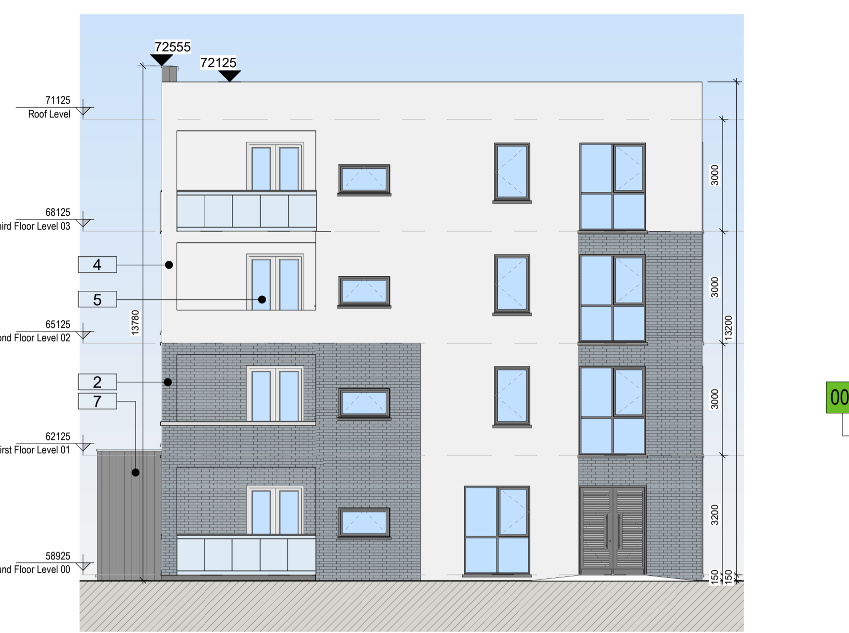
3 South Elevation 1 : 100