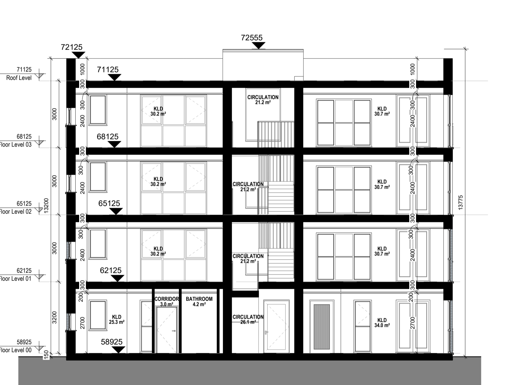
6 Section BB 1 : 100