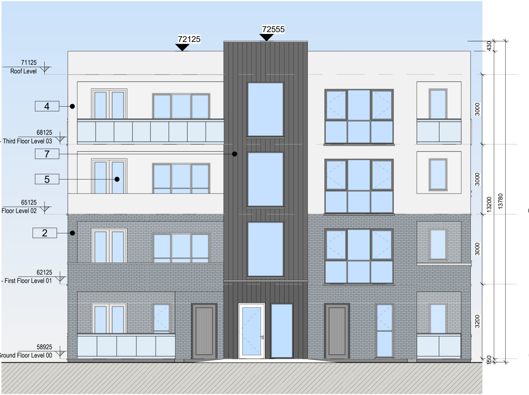
1 West Elevation 1 : 100

Please consider the environment before printing this sheet