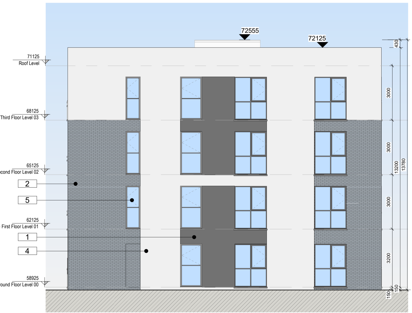
4 East Elevation 1 : 100