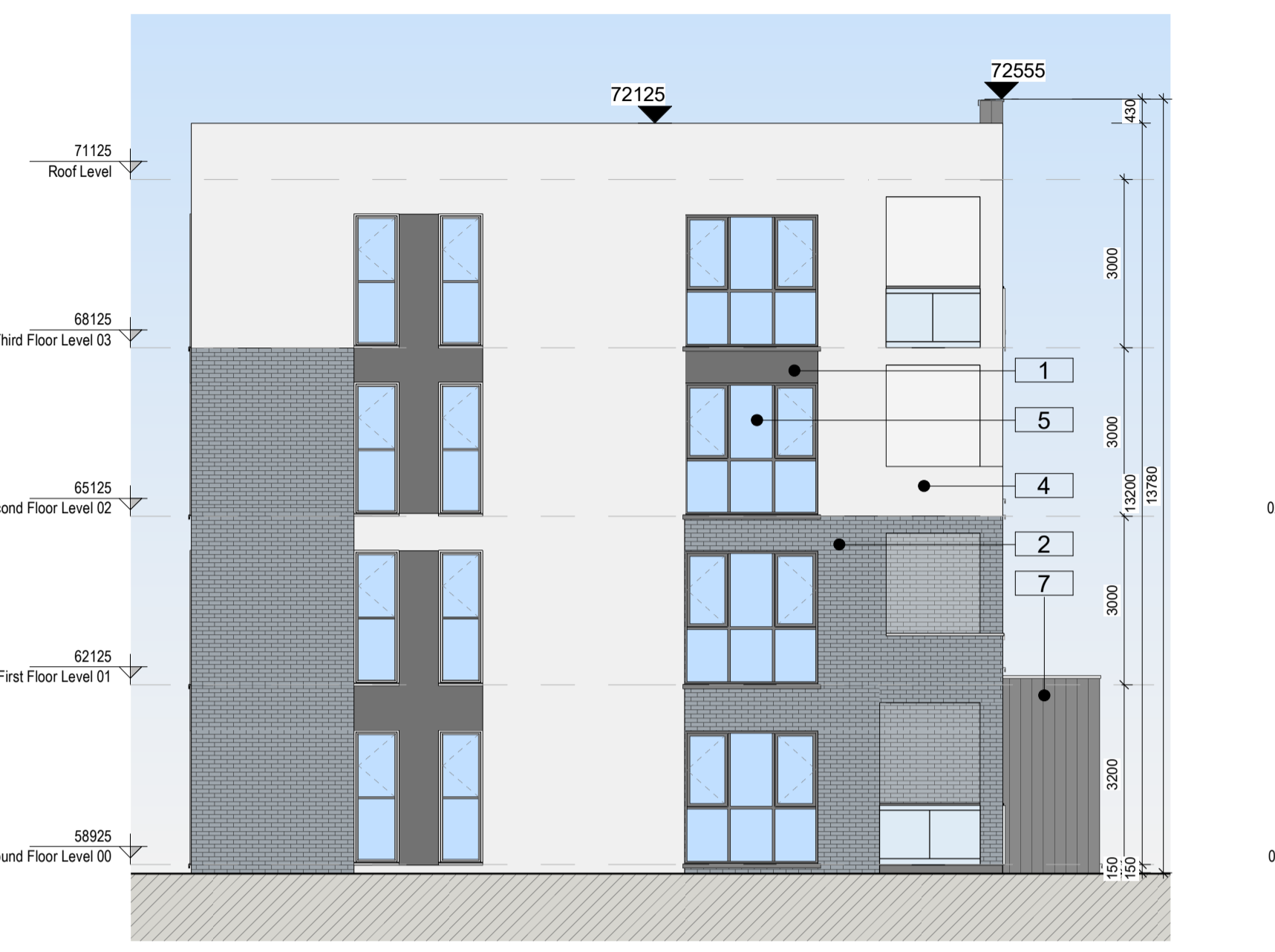
2 North Elevation 1 : 100